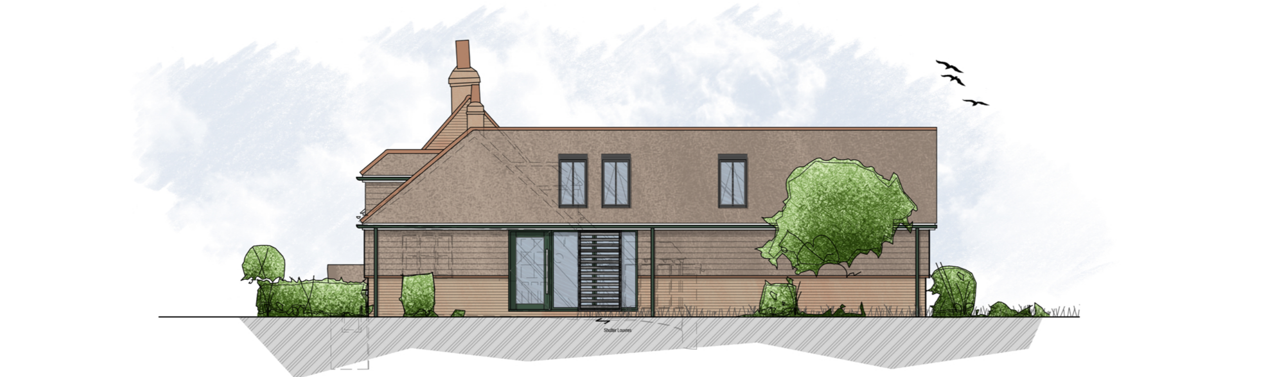
Proposed North Elevation

Fence line if house is split into two dwellings